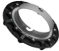
10 05 12 Speedring Elinchrom