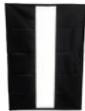
25 47 08 Softbox RFi 1x3' (30x90 cm)

The Flat Front Diffuser is mounted onto your Rectangular RFi or your Square RFi to make the surface completely flat. It can also be used as a neutral density filter to lower the output or to create an even softer and wider light spread.