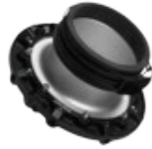
10 05 01 Speedring Profoto

The speedring adaptors are designed so that the RFi softboxes can be rotated 360°, allowing the photographer to adjust and shape the light on the fly. The color codes make the softboxes easy to assemble and disassemble, and all speedring adaptors are robust and painted with heat resistant lacquer. See reverse for a complete list of all compatible flash brands.