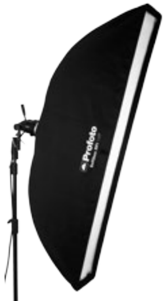
25 47 10 Softbox RFi 1x6' (30x180 cm)