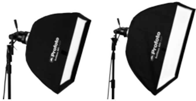
25 47 06 Softbox RFI 2x2' (60x60 cm)

The smaller version is particularly popular among mobile fashion and portrait photographers, who appreciate the fact that it is not only a highly controllable key light, but also lightweight and quick and easy and to set up.