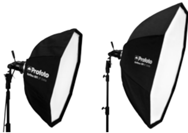
25 47 11 Softbox RFi 3' Octa (90 cm)

Fashion and portrait photographers requiring a soft, even yet controllable key light favor the smaller versions. The larger version creates a beautiful fill light and has a relatively flat shape, making it surprisingly easy to handle.