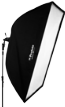
25 47 05 Softbox RFI 4x6' (120x180 cm)