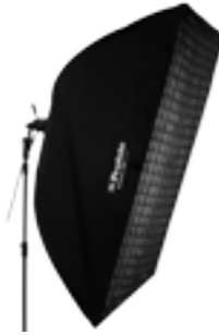
25 46 24 RFi Softgrid 50 degree 4x6'

All RFi softboxes have a recessed front that allows you to attach a Softgrid. The Softgrid reduces the light spread to 50°. In other words, the Softgrid creates a more directed light and eliminates a large amount of spill light, allowing you to shape the light with even more precision.