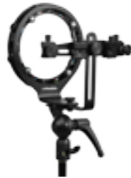
10 05 20 RFi Speedlight Speedring