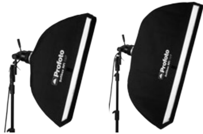
25 47 08 Softbox RFi 1x3' (30x90 cm)

In addition, the Strip RFi is a great asset when you are shooting in a confined area. It occupies very little space, and its narrow shape allows you to put it right next to a wall to create a soft and even back light.