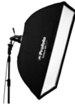
25 47 04 Softbox RFI 3x4' (90x120 cm)