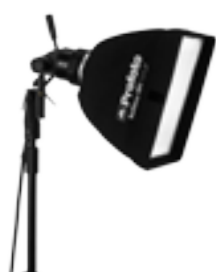
25 47 01 Softbox RFI 1x1,3' (30x40cm)

Utilize the rectangular shape to light an entire person, use a larger model as fill light or a smaller one as a soft and even key light that evens out skin tones. Use one or two or three – or combine several into a giant softbox. The possibilities are endless.