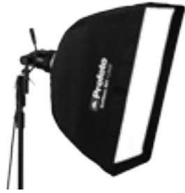
25 47 02 Softbox RFI 1,3x2' (40x60 cm)