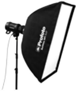
25 47 03 Softbox RFI 2x3' (60x90 cm)