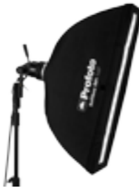
25 46 32 Stripmask 7cm for RFi 1x3'

The Stripmask is mounted onto your Strip RFi to create an even narrower light spread. Suitable for intricate highlights or when you want to adjust your set up without repositioning lights.