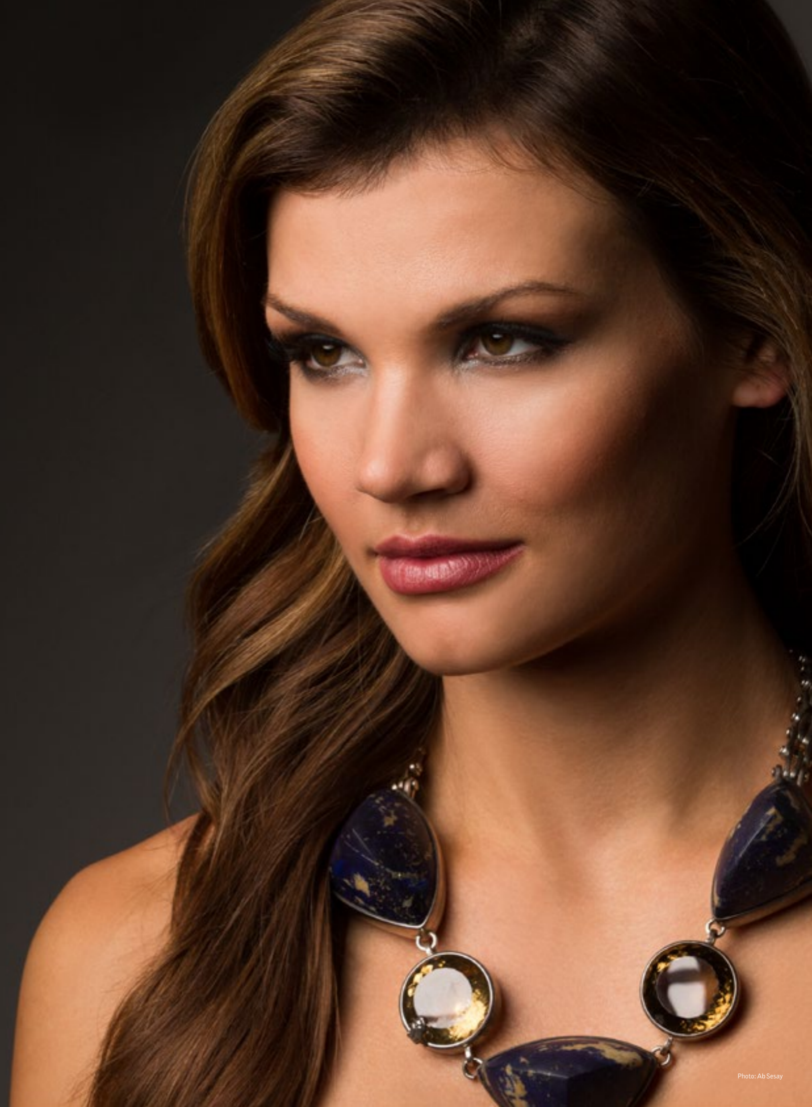
25 47 12 Softbox RFi 5' Octa (150 cm)